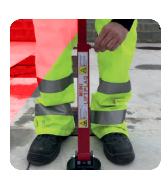
STEP 1 Keep the label visible from above for handling and lock the handle