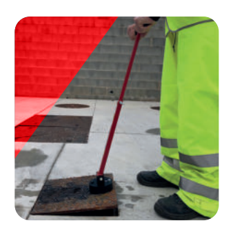
STEP 2 Magnetize on the edge, lift and pull